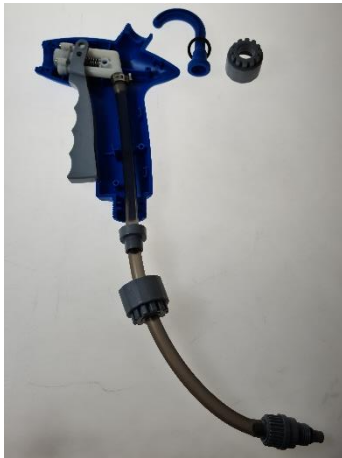
Bottom Load Gun

3) Remove old valve assembly and replace with new one, as shown: