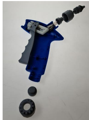
Top Load Gun

4) Replace screws, ensuring screws are replaced in the correct positions, and tighten to close gun body: