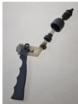
Top Load Valve