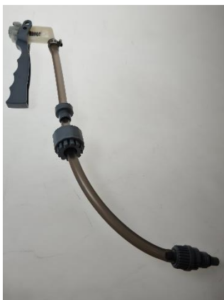
Bottom Load Valve