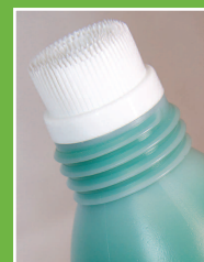
Integral brush applicator