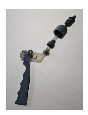
Top Load Valve