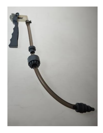
Bottom Load Valve

2) Check valve replacement is correct for style of gun: