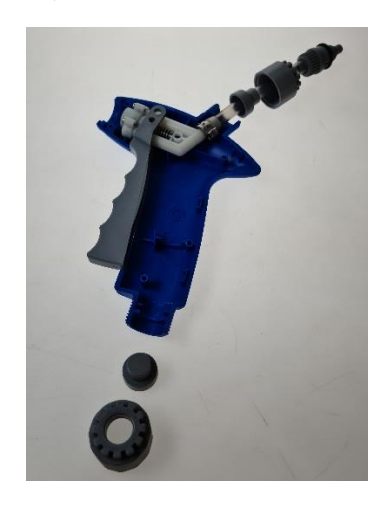
Top Load Gun

4) Replace screws, ensuring screws are replaced in the correct positions, and tighten to close gun body: