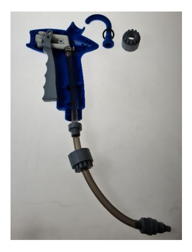
Bottom Load Gun

3) Remove old valve assembly and replace with new one, as shown: